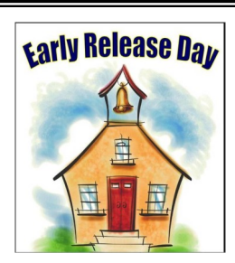
Tuesday, Sept. 14

Feb. 21 President's Day - No School Mar. 8 Early Release @11:40am Mar. 11 End of 3rd grading period