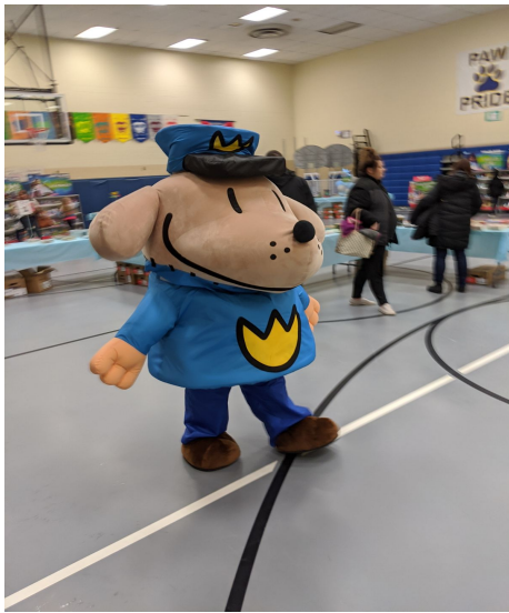
Dog Man visits with our Wildcats during our annual book fair!