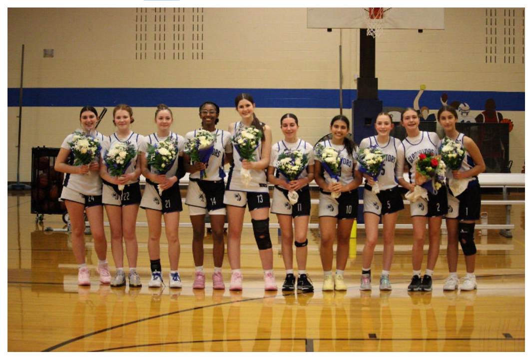
The Grimmer Girl's 8th Grade Basketball Team

Click Here for Grimmer's Athletic Calendar