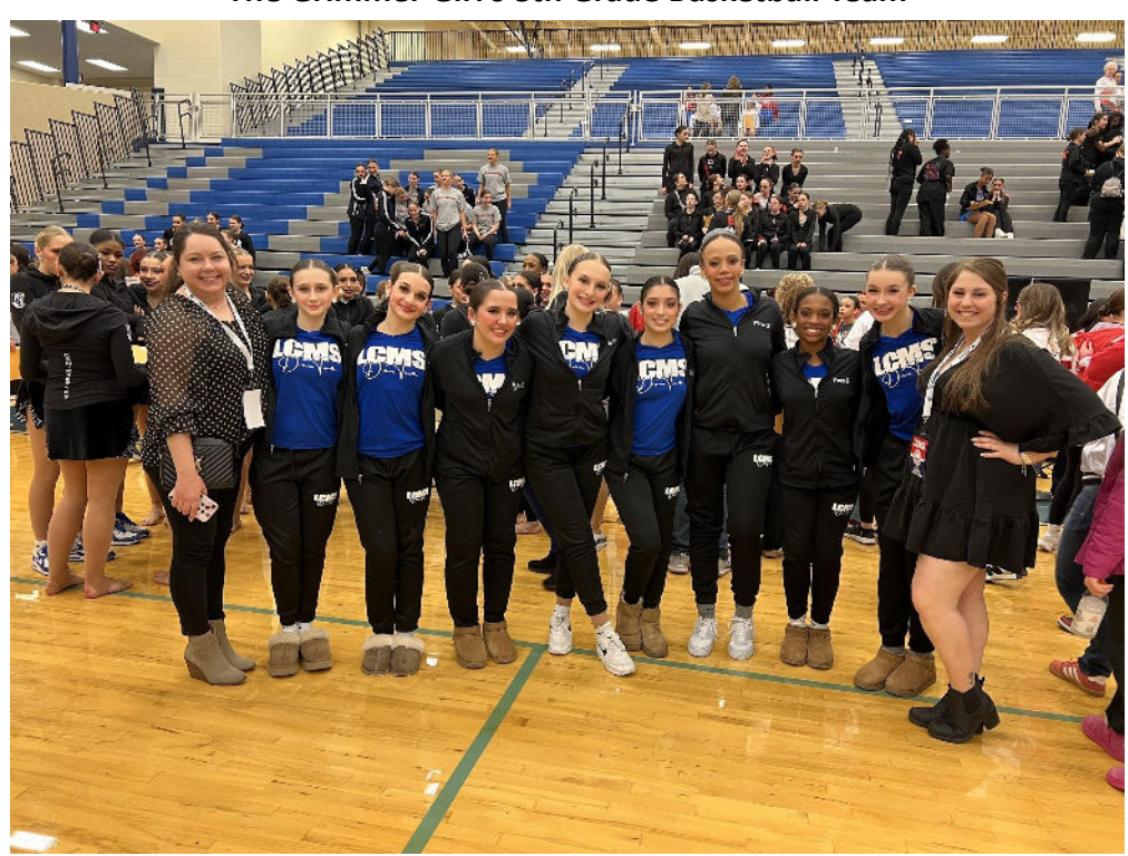
The Kahler-Grimmer Dance Team is State Bound!